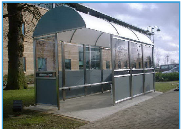
Low level FYBATEX panels installed in bus shelters.